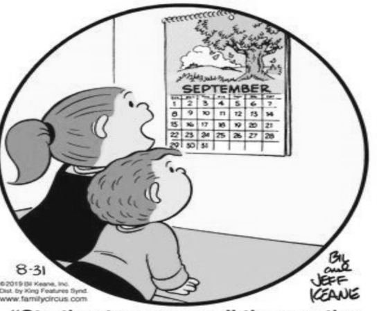
"Starting tomorrow, all the months end with 'brr' because it's getting colder."